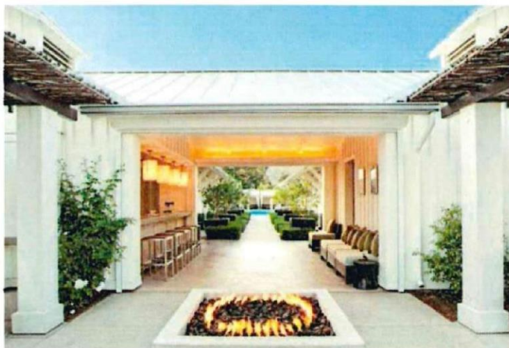
From top: Tank Garage Winery and a bottle of its finest (and feistiest), get your veggies at Calistoga Ranch's Lakehouse restaurant, and a warm welcome at Solage's geothermal bathhouse.